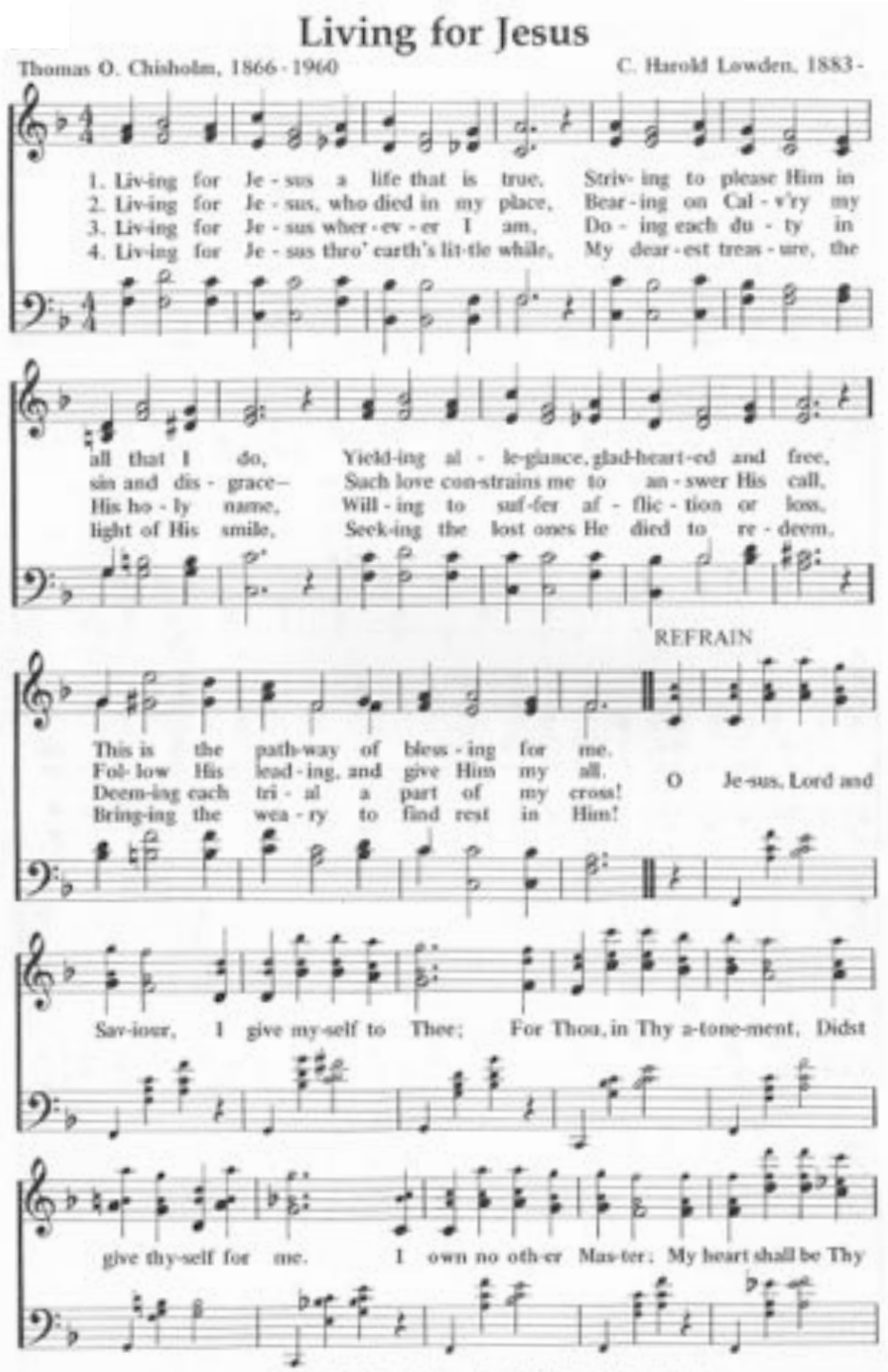
Copyright 1917 by Heidelberg Press. The Rodebraver Co., owner. U Renewed 1945, The Rodebraver Co. Used by permission.